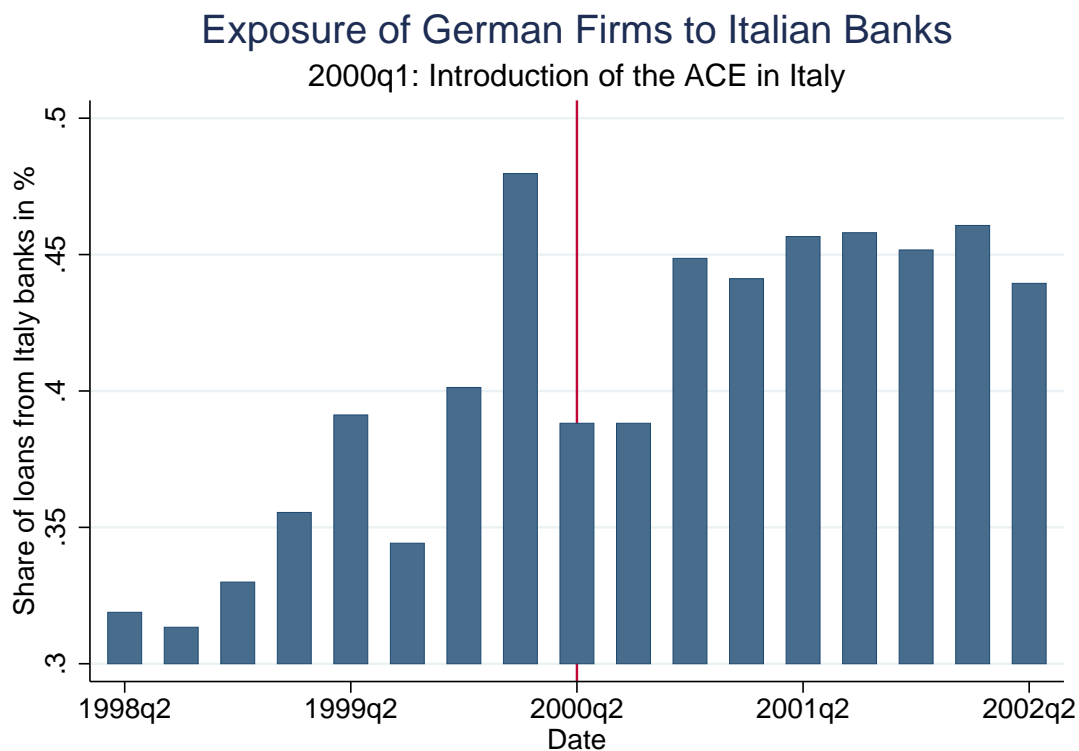
Figure 1. Evolution of German Firm Exposure to Italian Banks around the Introduction of the ACE for banks in Italy in 2000

This figure shows the evolution of the relative exposure of German firms to Italian banks over the 1998-2001 period. The red vertical line corresponds to the introduction of the ACE for banks in Italy in 2000. The relative exposure is computed as the ratio of loans from Italian banks to loans from other banks (in volumes).