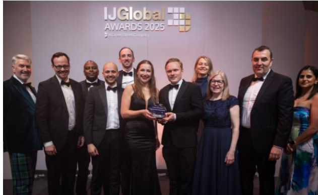
Source: Golbeck Solar , GOLDBECK SOLAR and Green for Growth Fund receive IJGlobal “Frontier Market Award” for Solar Project in Ukraine, March 2026

goldbecksolar plans to install 500MWp solar capacity in Ukraine.