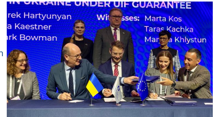
Source: Horizon Capital , Horizon Capital announces it acquired a 45% stake in the planned Notus wind park, January 2026

is developing a 120 MW wind park in Odessa region