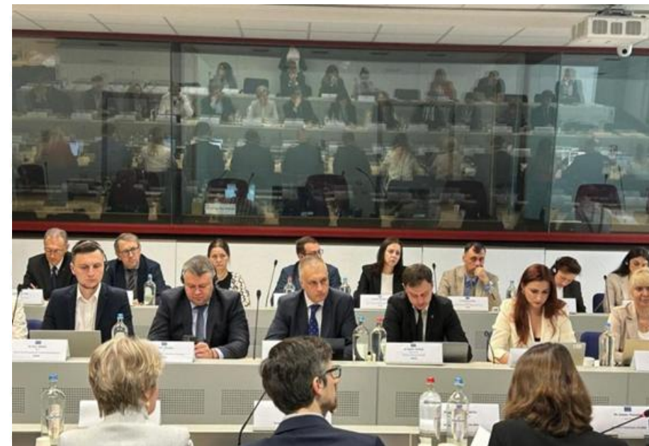
Ukraine and the EU launched the screening of Ukrainian legislation as part of EU accession talks on July 8, 2025 (Source: Ukraine and EU Launch Legislative Screening Process for Energy Sector Integration — UNITED24 Media )