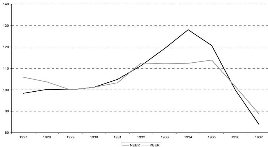
Chart 1: Effective Exchange Rates of the Italian Lira (Index 1929=100)

Note: The rise of the index means appreciation, the fall means depreciation.